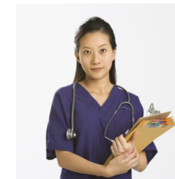
Sanford-Brown College in Phoenix offers allied health training for medical assisting, and phlebotomy. Soon the school will offer a dental hygienist program.