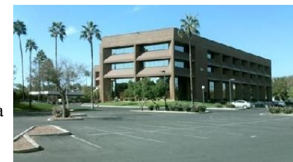
Sanford Brown College Campus - Phoenix

the area. The fairs offer the students an opportunity to practice their medical skills. The students would set up the fair, and provide many services alongside other providers, like Maricopa Integrated Health and the Department of Economic Security.