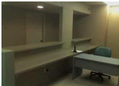
Completed renovation with 2 exam rooms.

the fair. In July 2010, HCHC added two new volunteer Family Practice physicians into the practice. HCHC now has a total of four medical providers. We have increased the number of patients we can serve in a month from 80 to 105. Also, Health Care Connect started screening our patients at the clinic to determine if patients qualify for Arizona's Health Care Cost Containment Services (AHCCCS) or their program to obtain medical specialty services. In a September board