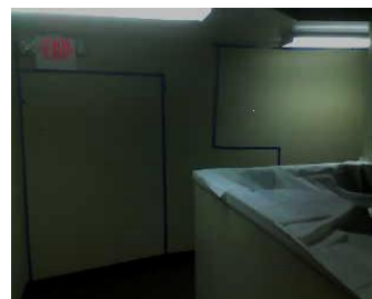
Taped wall to mark construction for HCHC's dental wing.